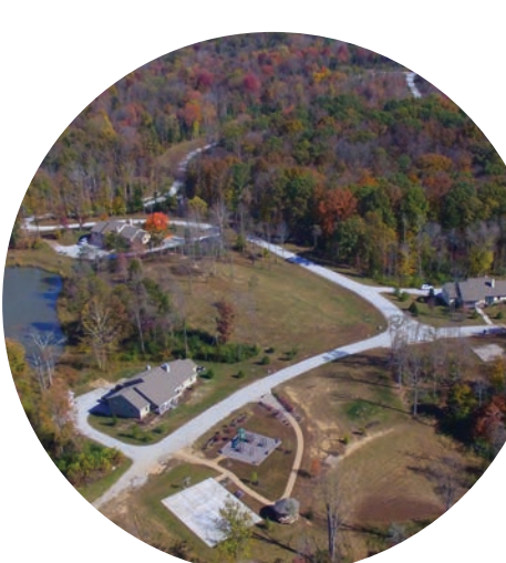
NEW SONG MISSION CAMPUS

God has blessed New Song with an incredibly experienced team of staff members who can help students develop confidence and character. Our academic program is overseen by licensed teachers and administrators, and our classroom is highly effective because we have learned the importance of providing boys and girls with a very personal and individualized education. We know what works with students and how to help them reach their great potential in school and in life.